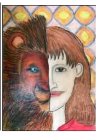
Cassidy Copenhaver, 6 th