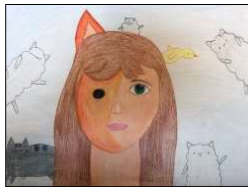
Breeden Hall, 6 th