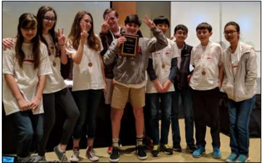
Cario's 7 th /8 th grade team won 2 nd place overall. WAY TO GO!

🌿 Last month Cario participated in the Quest Competition. QUEST is Trident Technical College's annual academic competition that is open to Berkeley, Charleston and Dorchester public school students in grades 6-12. The competition was developed by TTC to promote academic excellence, provide an academic challenge to students, and recognize top students, teachers and schools. This day-long competition is held at TTC's Main Campus and students compete in mathematics, science, social studies, composition, public speaking and visual arts. This year, students from 41 public schools battled for top honors. Congrats and great work to all of Cario's Quest teams!